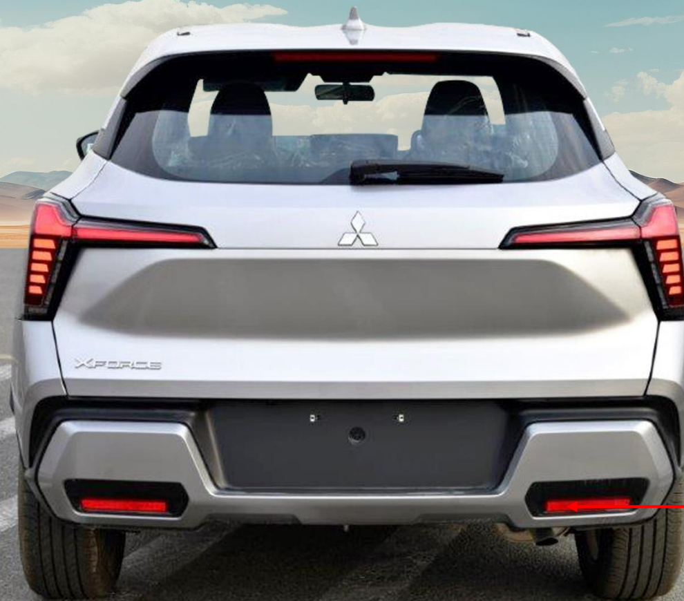
REAR LED BUMPER LIGHT