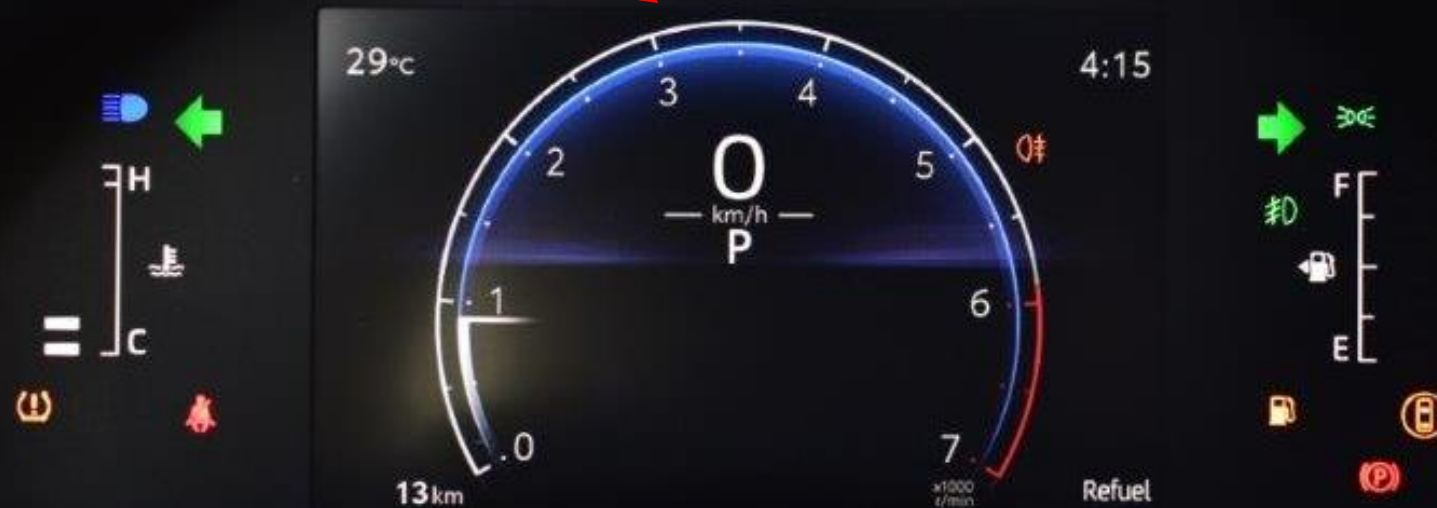
OPTITRON TYPE COMBINATION METER 7"MULTI INFORMATION DISPLAY