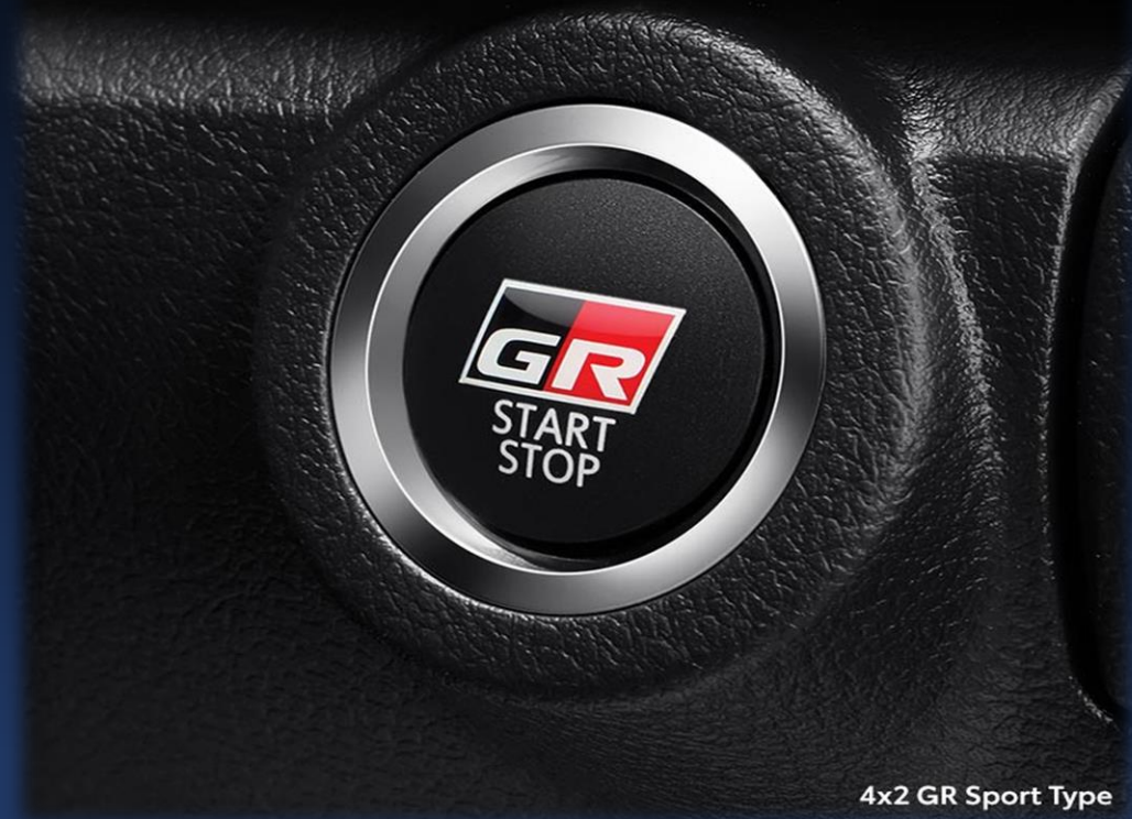
4x2 GR Sport Type